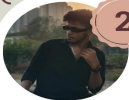
OM LOHAR SYBAMMC